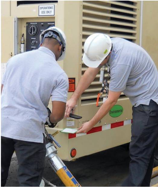
Figure 4. Two Auxiliary Operators use the CBP System during the April 2014 Field Evaluation Study.

In order for CBP system to provide the highest value to the nuclear industry, it needs to encompass more than just procedures for auxiliary operators. The CBP system needs to be able to handle all types of instructions, checklists, procedures, work orders and other documents used in the plant. The vision is to have all the different organizations within the plant use the same system. To achieve the goal of one system the researchers have to make sure the system will be able to handle a broad variety of tasks and situations; therefore, collaborating with multiple utilities and multiple organizations within the utility (e.g., Operations, Maintenance, and Chemistry) is essential. Hence, a series of field tests will be conducted at multiple utilities to ensure that the result from the current research effort is applicable both within individual plants and across the fleet of utilities.