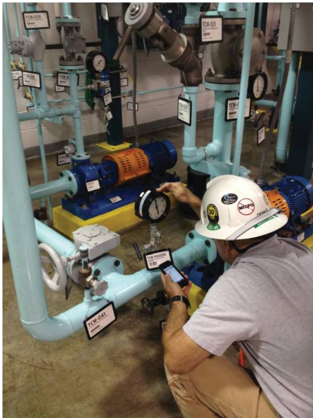
Figure 3. An Auxiliary Operator uses the CBP system as a part of the November 2013 Evaluation Study.

The third study also was the first of the ones conducted where there was no significant time difference between conducting the task with the paper-based procedures or CBPs. The researchers identified three main reasons for the potential time difference between using paper-based procedures and CBPs in the studies. First, the design concepts used in the CBP needed to be refined based on the input from the participants to adequately provide performance benefits. Secondly, the participants only received a brief training on the CBP system before they were asked to conduct the task using the CBP system. In the real world, the users would receive more extensive training. The reason for the brief training was to investigate how self-explanatory and user-friendly the design of the CBP system is. Lastly, even though the participants were instructed to save any comments about the CBP system until they had completed the task most of them were quite eager to share their impressions with the researchers while conducting the task. This phenomenon did not happen when they conducted the task with the traditional paper-based procedure. Figure 3 below depicts one of the participants in the evaluation study conducted in a flow loop facility in November 2013.