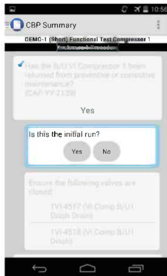
Figure 1. A screenshot from the CBP system, developed by the research team, showing an example of simplified step logic.

A conditional step in a procedure is a step that is based on plant condition or combination of conditions to be satisfied prior to the performance of an action. The CBP removes complexity from step descriptions by presenting IF/THEN, WHEN/THEN, AND, OR, etc. statements as simple questions. For example, conditional statements such as “IF starting pump A, THEN perform the following...” are presented as “What pump do you want to start; Pump A or Pump B?” Depending on the answer, the procedure will take the operator to either a step with the actions needed to start the Pump A or the step with the actions needed to start Pump B. Figure 1 shows an example of the simplified step logic. In this example, the CBP system asks a yes/no question instead of presenting an IF/THEN statement.