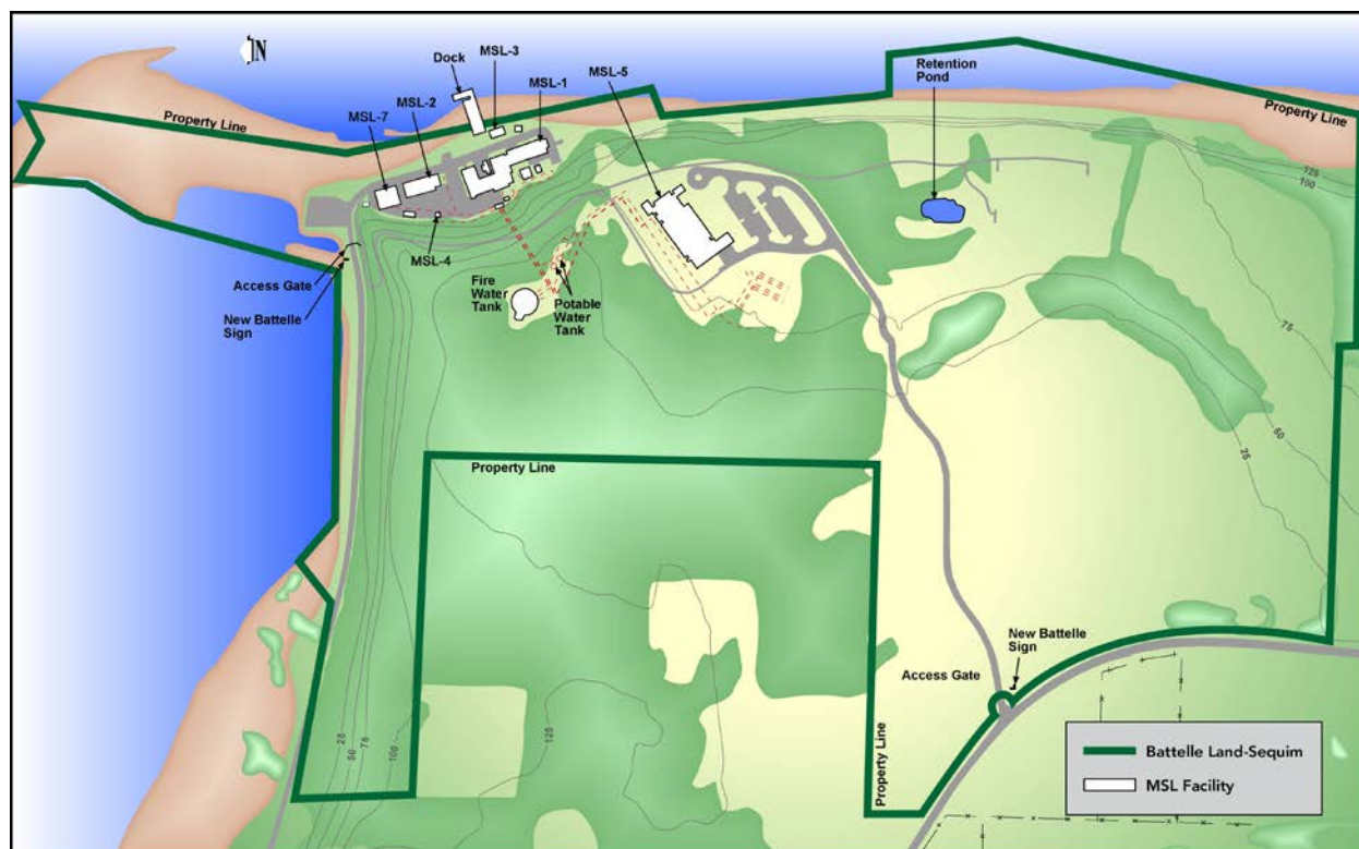
Figure 1.2. Battelle Land-Sequim and Marine Sciences Laboratory

Battelle Land-Sequim on Washington State's Olympic Peninsula is the site of DOE's only marine research laboratory. It lies on the shores of the Strait of Juan de Fuca and is in the rain shadow of the Olympic Mountains in Clallam County at approximate coordinates 48°04'40" N, 123°02'55" W. Despite its coastal location, it receives less than 15 inches of rainfall on average annually. Average monthly temperatures range from 31°F to 70°F. Nearby cities are Sequim (population 6,600), Port Angeles (population 19,000), and Port Townsend (population 9,100) (DOC 2011). Seattle is approximately 50 miles (mi) from MSL. The nearest sea border with Canada is about 17 mi from MSL in the Salish Sea; the nearest Canadian land border is about 25 mi northwest from MSL.