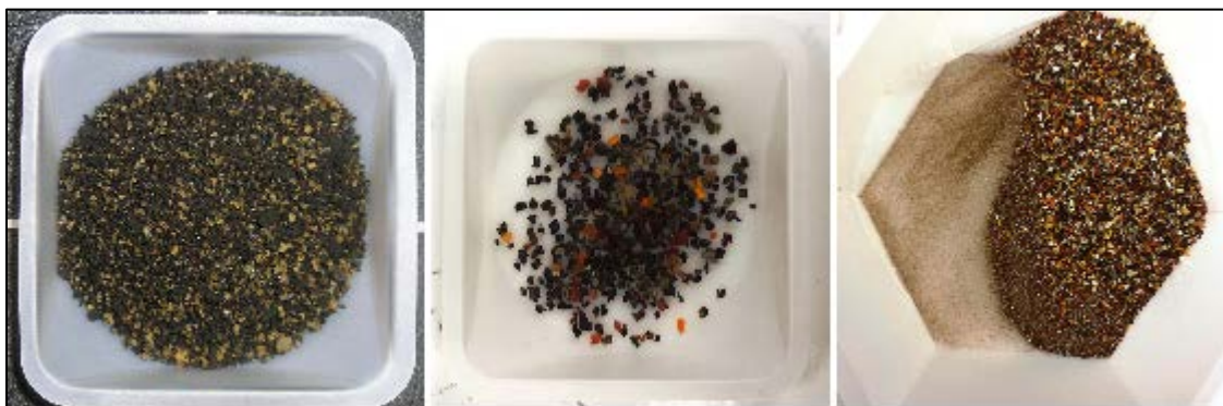
Figure 1. Effects of NO aging on Ag 0 -aerogel (L to R: 0 month, 1 week, and 1 month aged Ag 0 -aerogel).

Exposure to 1% NO gas significantly affected the structure and appearance of the aerogel. As shown in Figure 1, an initial change in material color was observed after 1 week of aging. The black granules did not change color, but the lighter colored granules turned bright orange and red. After 1 month of aging, a substantial amount of fines had developed and the material was mostly dark brown with orange, white, yellow, and red granules dispersed throughout. The material was sieved through a 30\times 30 mesh, and the fines were found to constitute 30% by weight of the material remaining in the tube after the 1 week sample was removed. The fines were not returned to the tube furnace for continued aging. No additional change in color was observed upon 2 months of aging, and no significant amount of additional fines was created during the second month of aging.