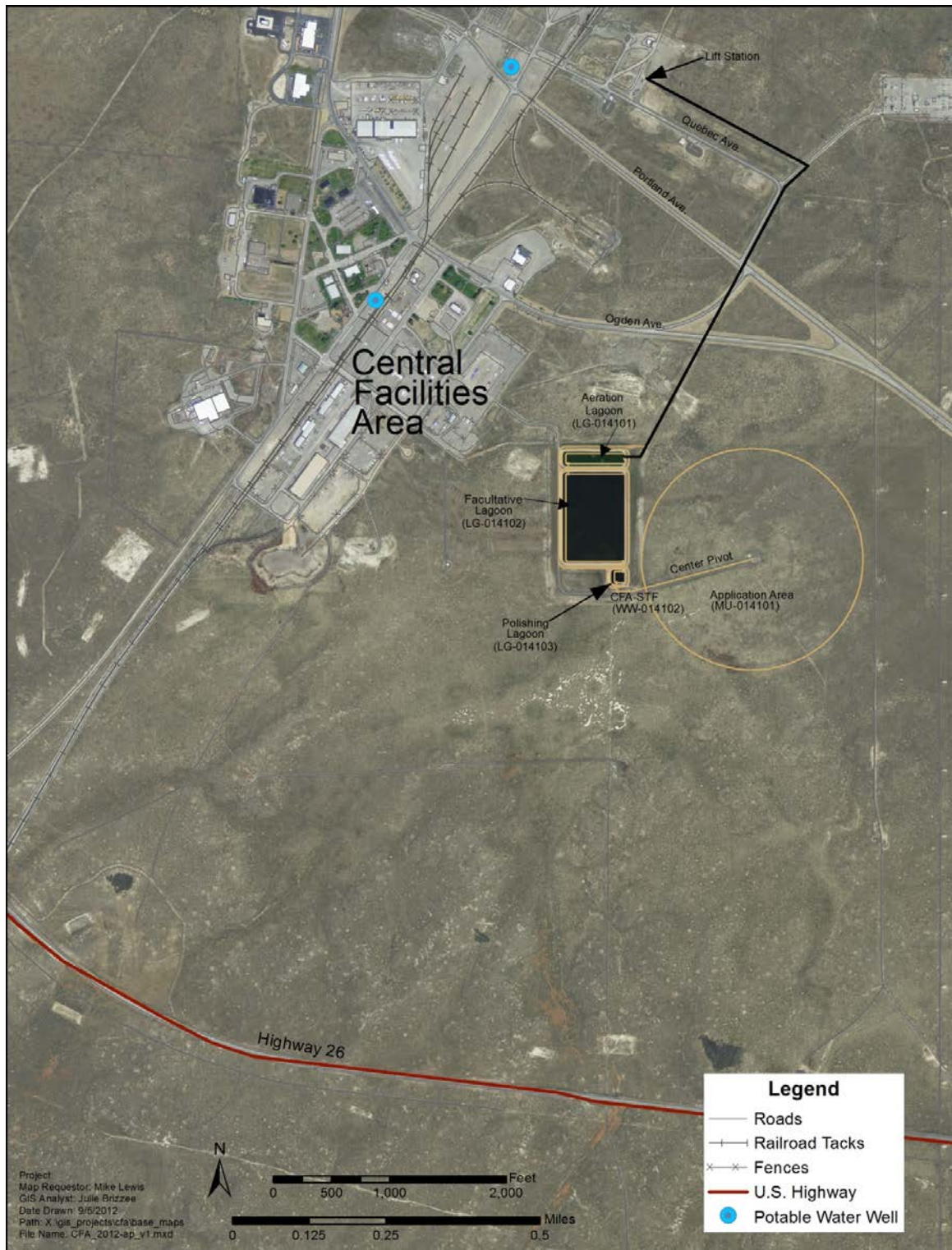
Figure 1. Area map showing the location of the Central Facilities Area Sewage Treatment Plant.

A 350-gallons/minute pump moves wastewater from the polishing lagoon to the center-pivot sprinkler system, which waters the land application area at low pressures (about 30 lbs/in 2 ) to minimize aerosols and spray drift.