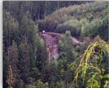
Photo 2. Overview of Powerhouse Road Construction

A limited amount of new access road will be needed to construct the Project. The major landowner, Sealaska Corporation, constructed much of the road system when the area was logged. It is estimated that less than 3000 feet of new road will be required to access both the powerhouse site and the diversion site. Access roads constructed in conjunction with the Project are of the same design as the primary logging roads.