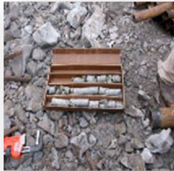
Photo 3. Soil Core Samples

The following activities have been performed since 2010, with funding assistance provided by the DOE's Renewable Energy and Energy Efficiency Deployment in Indian Country grant program: