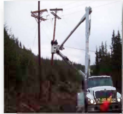
Photo 5. Transmission Line Installation

The Project's transmission line has been increased in length by about 1.1 miles. The extension follows the path of an existing 2.4 kV line and required the installation of new poles. The Project's transmission line conductors were installed at the top of the poles and the existing 2.4 kV line was installed underneath. The extended line interconnects with the existing 34.5 kV line in Hydaburg. The resulting total length of the transmission line is now about 12 miles.