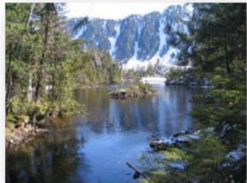
Photo 1. Rich's Pond from Outlet to Inlet

A bypass pipe will pass directly through the center of the diversion structure. This bypass pipe will provide uninterrupted flow to the bypass reach downstream of the diversion. The bypass pipe will be oversized for the required flows. The inlet of the bypass pipe will be protected by a bar structure to prevent debris from entering. The outlet of the bypass pipe will be equipped with either an orifice plate or valve which will be used to regulate discharge flows.