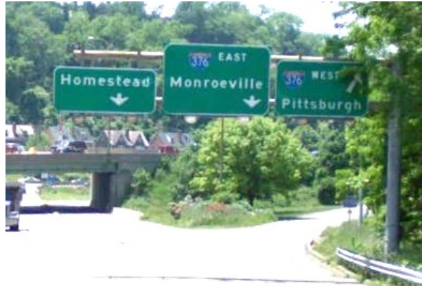
Fig. 2. Visual information that does not match the labels on the map.

There is also a problem when there is limited semantic information to present to the user. Google now provides walking directions, which includes not only named streets, but also unnamed sidewalks.